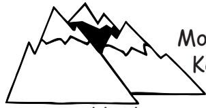
Mount Kenya is the

second highest mountain in Africa. Kenya means "mountain of brightness" in the Kikuyu language.