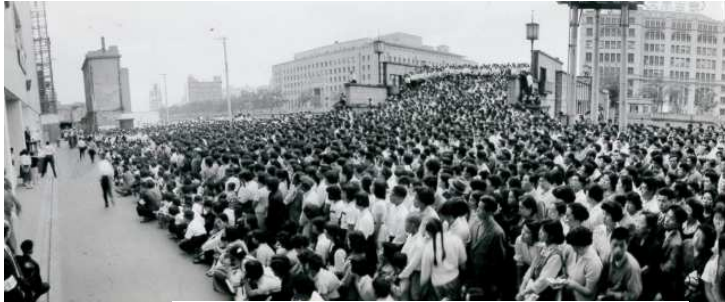
Overflow from Saturday afternoon youth meeting. Held outside for them

"His name is like perfume poured out." Song of Solomon 1:2