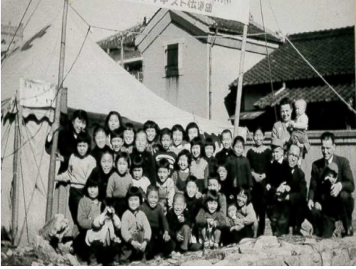
De Shazer and Japanese youth 1954

sades together. Is that amazing or what?!?!