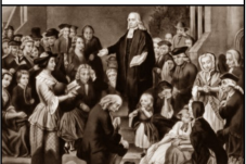
A metodisták története 1703-1860