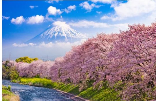
Sakura season in Japan has just passed. It was short but amazingly beautiful and sweet.