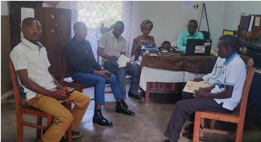
Nundu School of Nursing staff