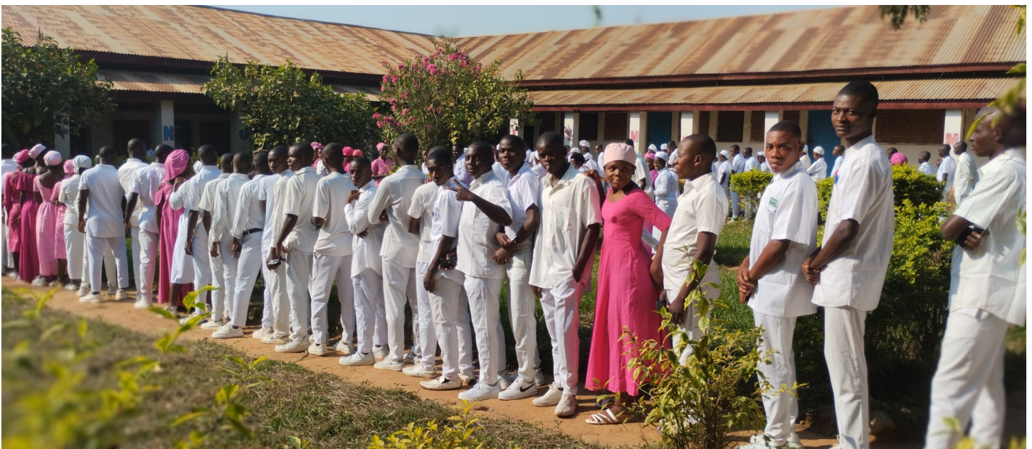
Students lining up for class