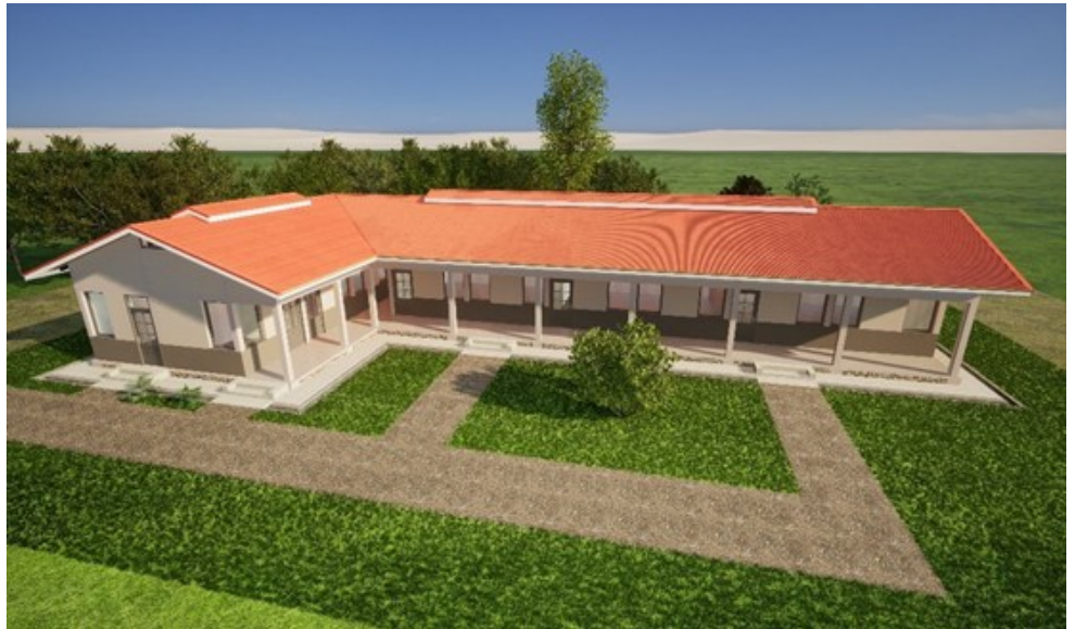
Computer generated model of the of the new classroom building