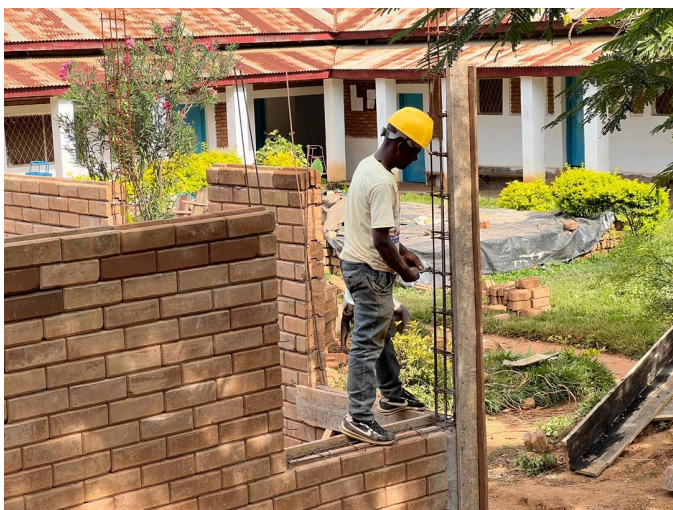
Phase 3 of the Nundu School of Nursing expansion project.

Though the Nundu School of Nursing has been impacted, for the most part classes have remained in session. Yes, the building project to provide dedicated classrooms for the nurse midwife students has been on hold from time to time. Now construction has resumed and funds for the next phases, 3 and 4, have arrived. We have requested that the final report date be reset from April 1 to June 1, but more realistically we are looking at a completion date of July 1.